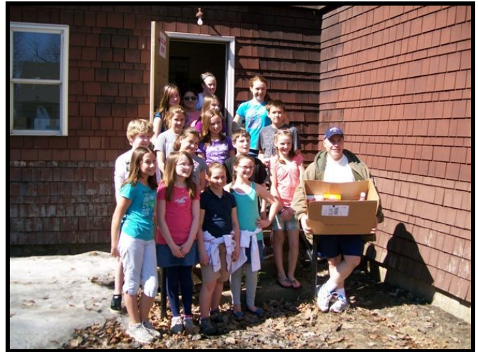
Conway Elem. Student Counsel donated several boxes of food in March