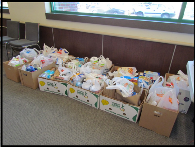
Food Drive at Shaw's