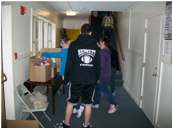
Kennett Middle School 8th Grade Math students used a lesson on Pi to collect food and money for the Food Pantry.